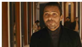
TABLE FOR 3

At the mercy of the dentist's chair, the protagonist cannot escape the confrontation with pain and the dregs of the miserable human condition. To distract himself, he takes refuge in a fantasised story of fishermen and the sea.